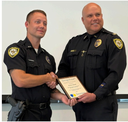
ABOVE PHOTOS: Recipients of 2026 Officers of the Year Awards