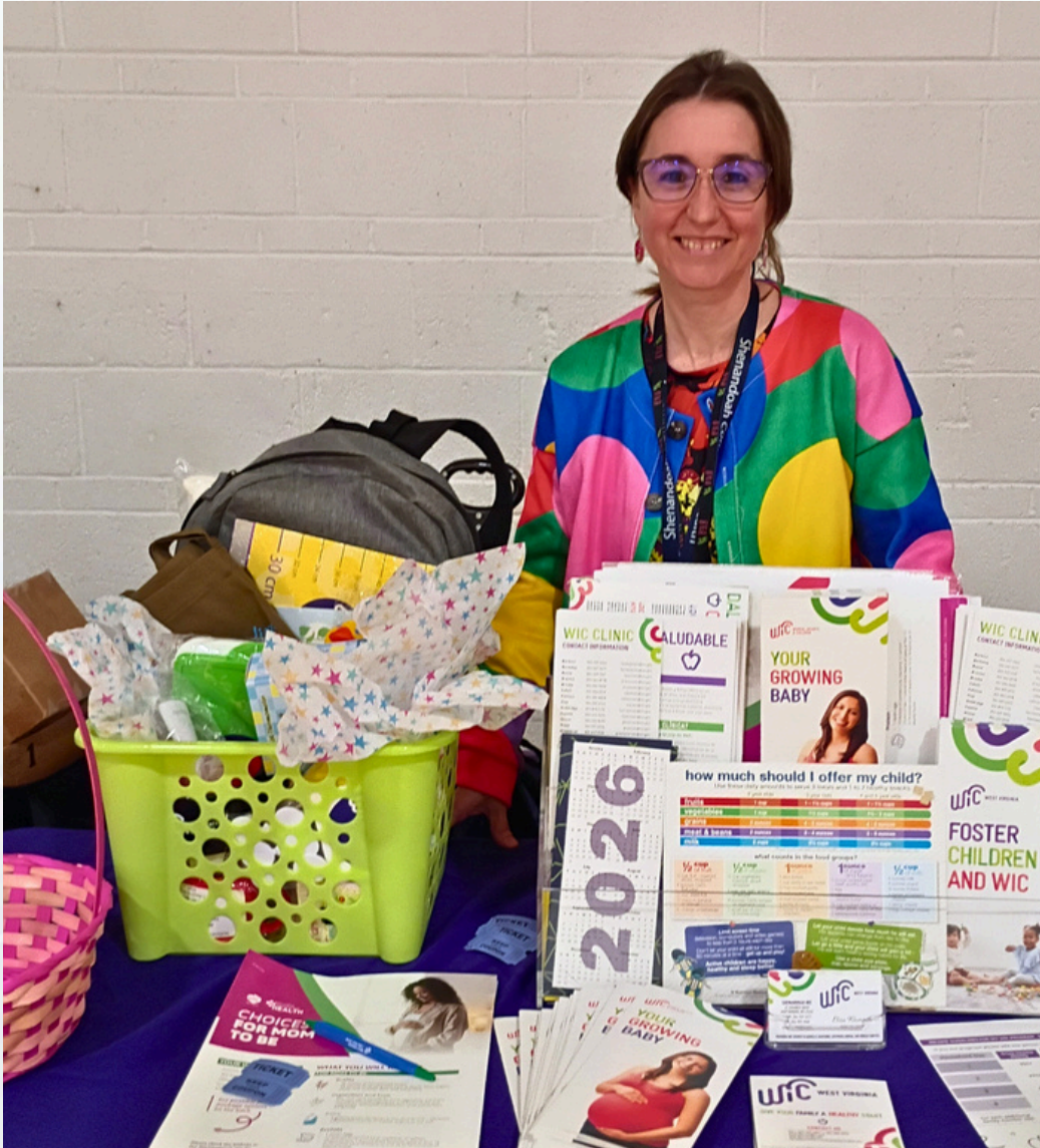
ABOVE PHOTO: A WIC Staff Member at their table of giveaways during the Community Baby Shower Event