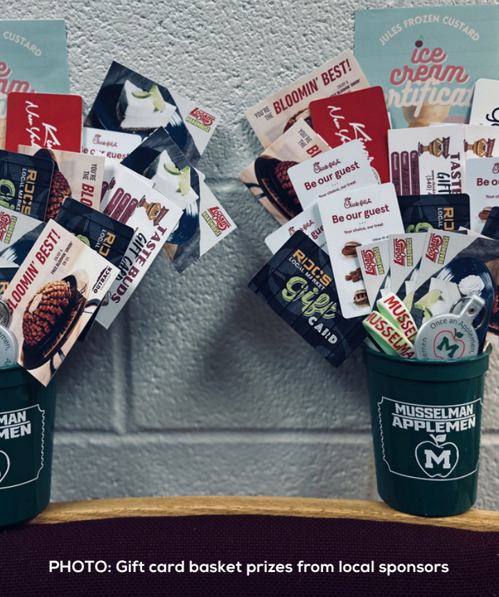
PHOTO: Gift card basket prizes from local sponsors