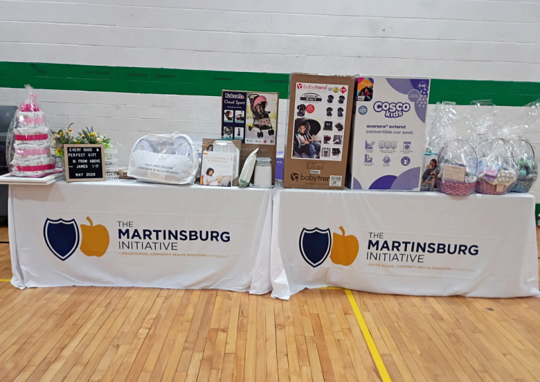
ABOVE: TMI's table setup stocked with giveaways.