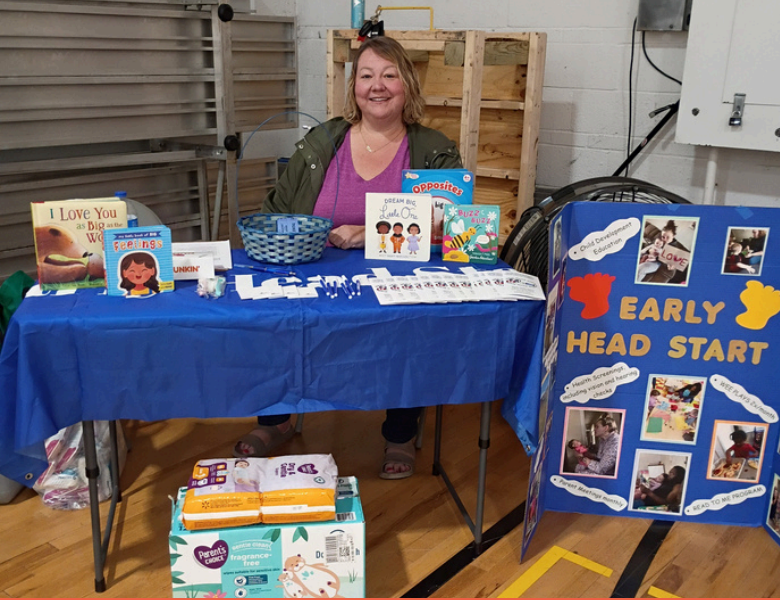
ABOVE: Early Head Start's table setup

Events like this Community Baby Shower don't just distribute goods; they build relationships, reduce isolation, and plant seeds of trust between families and the organizations that serve them. The Martinsburg Initiative is grateful to every partner who helped make this vision a reality. This event would not have been possible without the generosity of the following community partners and donors: