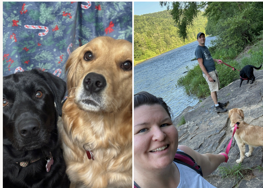
TOP PHOTO: Luna (a black lab-collie mix) and Roxy (a golden retriever).