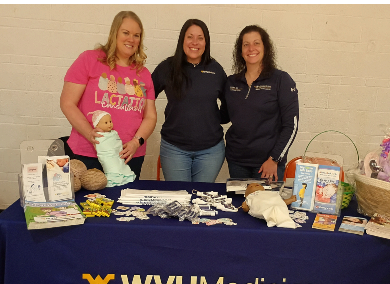
ABOVE: WVU Medicine Staff poses together at table.

"I was one of the lucky moms who attended the community baby shower. I honestly had such a good time. Everyone there was so nice and very helpful. It's been very hard with a newborn baby, so it was great to take a break to eat, play games, and win prizes! I left the event with many things I actually needed. I think it went amazingly well, and thank you to everyone involved. I would love to see more Moms come out to this event next year."