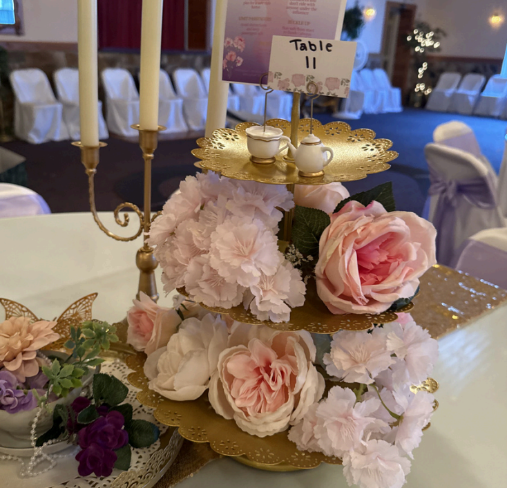
PHOTO: Table Decor at Musselment High School Prom

“THE VERY FIRST YEAR THEY DID IT, I HAD TO TAKE THEM MORE STICKERS. THEY RAN OUT AND REQUESTED MORE. THEY’VE BEEN GREAT.”